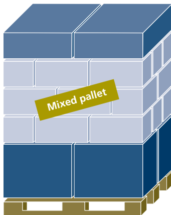
“Mixed pallet” labelling

It is not permitted to exceed the floor space of the EUR-pallet. The goods and packaging may not extend over the edge of the pallet.