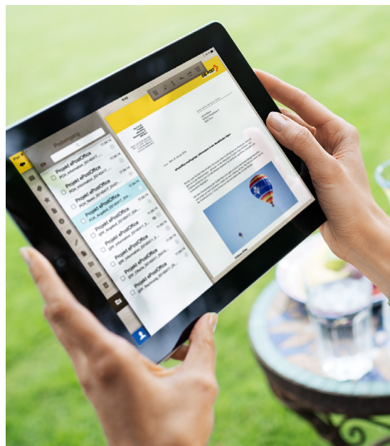
Access your post any time and anywhere.

E-Post Office offers a scan service as a paid subscription: Swiss Post automatically scans your consignments and makes them available to view, edit and archive in E-Post Office.